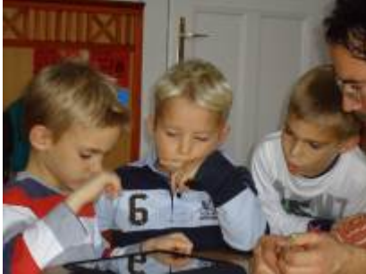
Students use iPads to reinforce the skills learned